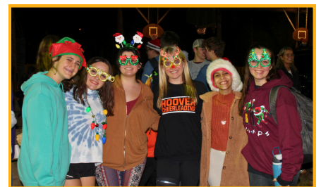
Winter Camp Weekend December 6-8, 2024

Reconnect with your summer pals while developing leadership skills