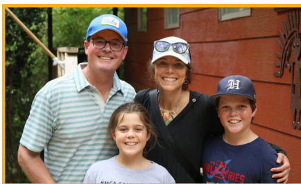
Fall Family Day October 19, 2024

Connect with families, while enjoying nature and fall activities