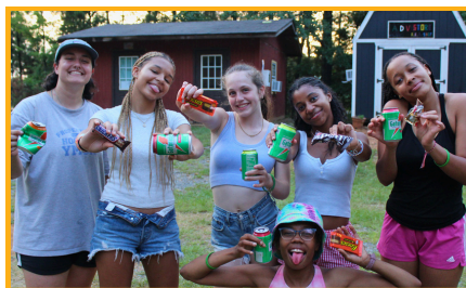
Teen Retreat Weekend November 1-3, 2024 Ages 13-15

Connect with families, while enjoying nature and fall activities